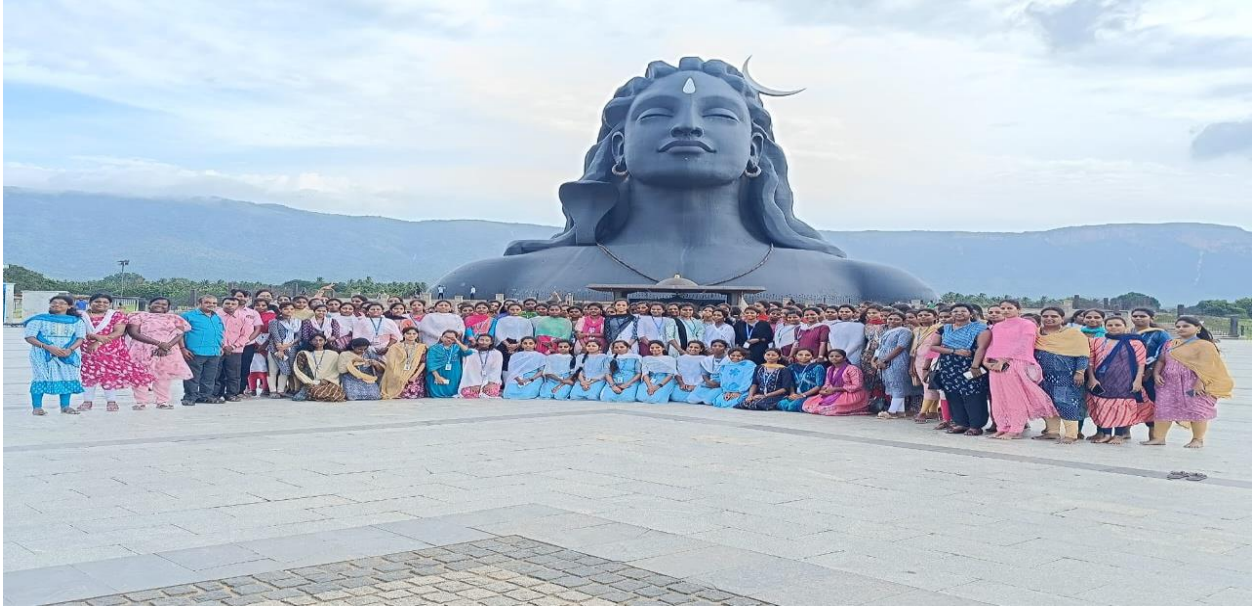
The students of our College were taken to an Industrial Visit to Coimbatore on 4.9.2024 .