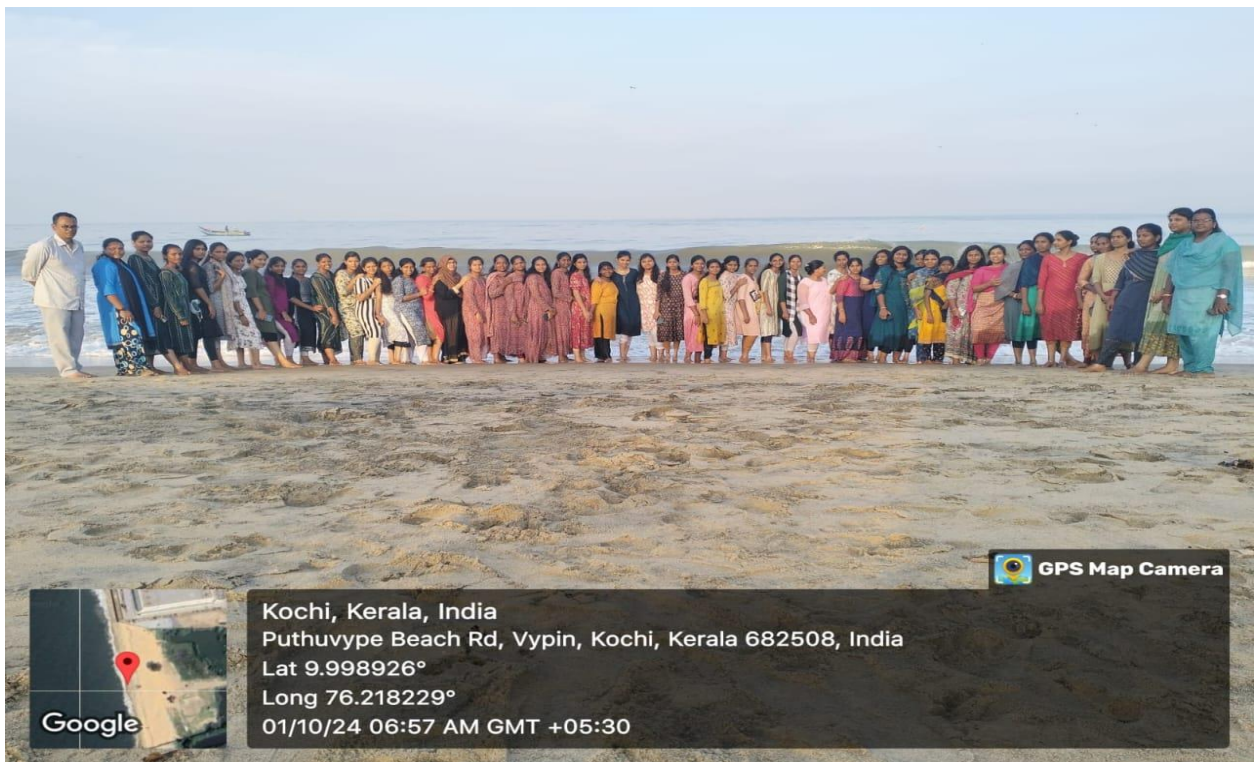
The Department of Commerce went to Educational Tour to Wonderla and Vagamon on 01.10.2024 .