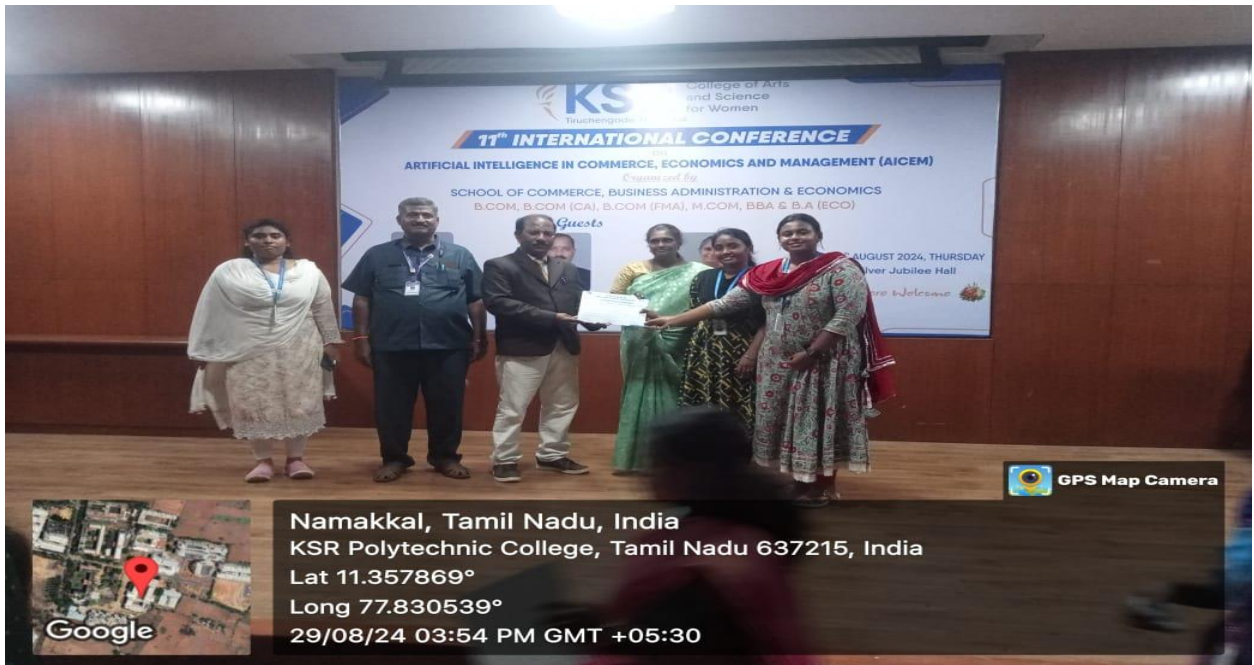
21. II PG Students of Commerce participated in 11 th International Conference on “AI in Commerce, Economics and Management Studies” organized by K.S.R. College of Arts and Science for Women on 29.08.2024 .