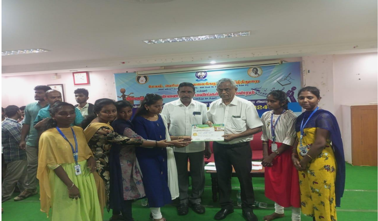
16. II UG Students of Computer Science and Applications participated in “ Tamil Essay Writing Competition ” organized by Periyar University, Salem on 06.09.2024 .