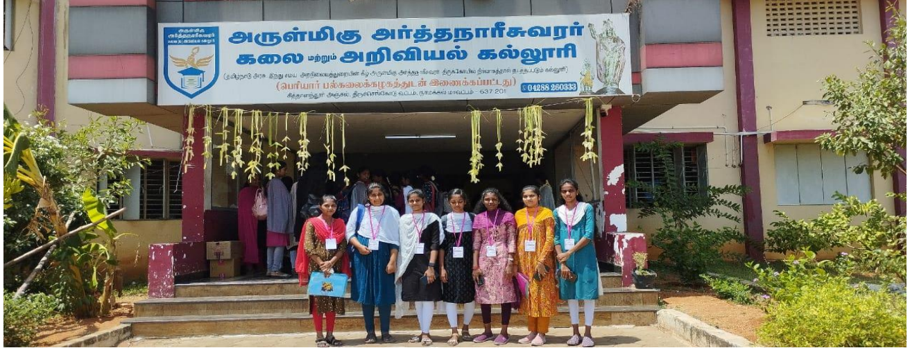
18. II UG Students of Computer Science and Applications participated in “Symposium” organized by Arulmigu Arthanareeswarar Arts and Science College, Tiruchengode on 20.09.2024.