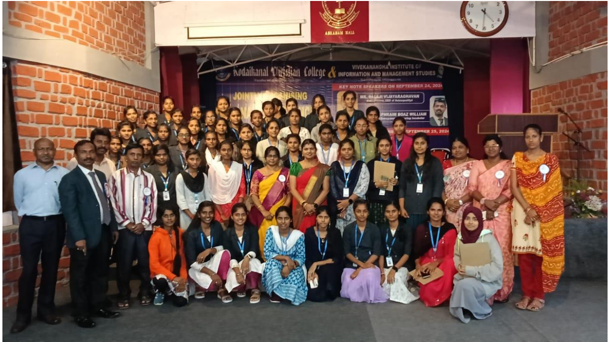
The Department of Computer Science & Applications went to Educational Tour to Kodaikanal on 24.09.2024 and 25.09.2024 .