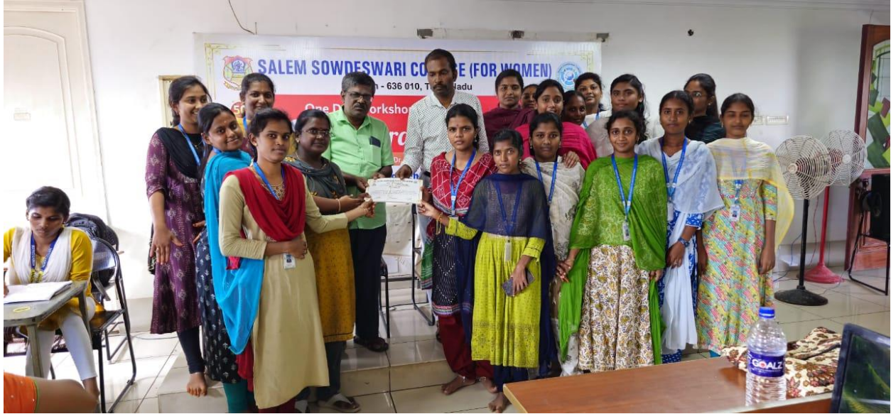
20. II PG Students of Commerce participated in One day Workshop on “SPSS Tools Practice” organized by Sowdeswari College for Women, Salem on 23.08.2024 .